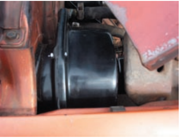
When installing the complete cover make sure to use a generous amount of silicon to seal the extension to the firewall.