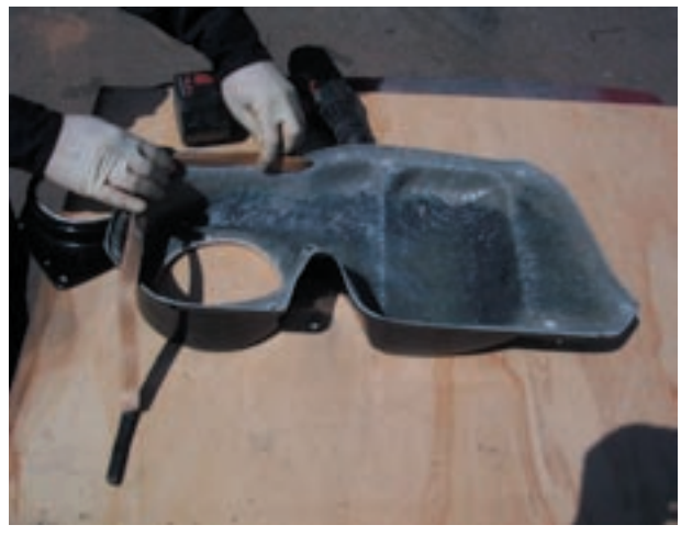
Next, use either the 3M silicon, or the windshield ribbon to provide a good seal from the extension to the AC Delete cover.