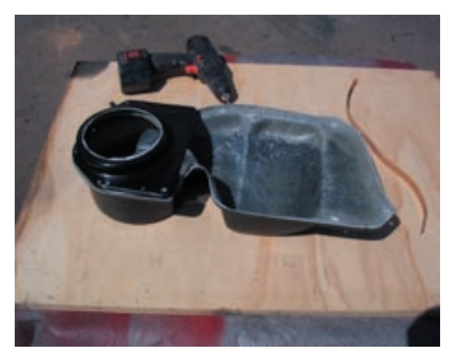
You will need a 5/32" drill bit, standard drill, either a 3M black silicon. or windshield ribbon (as pictured below).