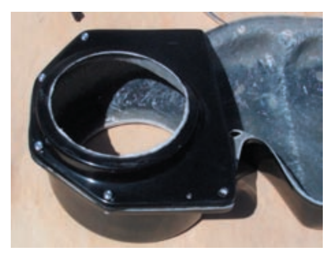
Attach the extension to the new AC Delete cover using the nuts provided. To keep the nuts from coming loose use a small amount of silicon on the end of the screw.