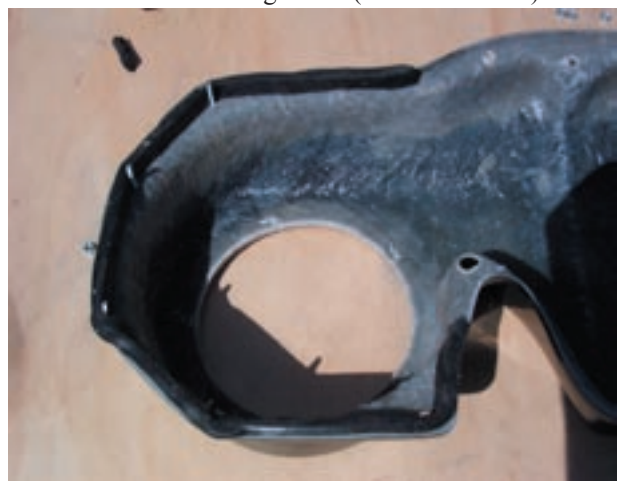
Using the hardware provided (#6 machine screws and nuts) insert the screws making sure not to brake the bead of silicon or ribbon.